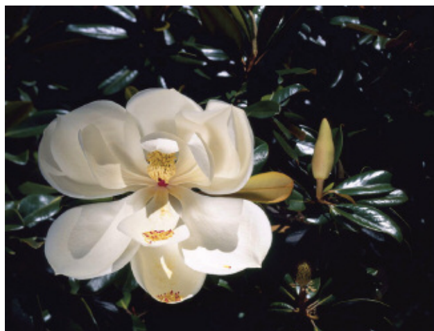
Gamble House garden, Palo Alto, California.